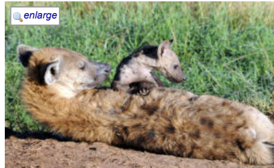
Researchers at MSU's BEACON have been studying hyenas in Kenya for more than 20 years.

The above story is reprinted (with editorial adaptations by ScienceDaily staff) from materials provided by Michigan State University .