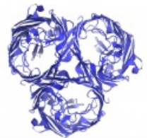
Ribbon diagram of the Omp protein, Lambda’s new pathway into E. coli .

Click on an image to view a larger or high-resolution version.