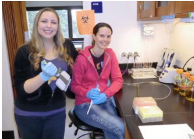
U of Washington

“The rate of environmental deterioration can qualitatively affect evolutionary trajectories,” the authors wrote. “In our system, we find that rapid environmental change closes off paths that are accessible under gradual change.”