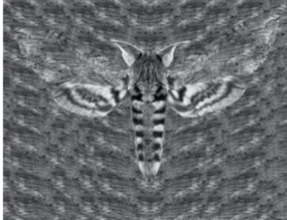
Artificial life from a digital sea

"The big question is: how did we get here? Our intelligence didn't evolve all at once," says